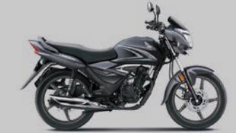
GENY GREY METALLIC