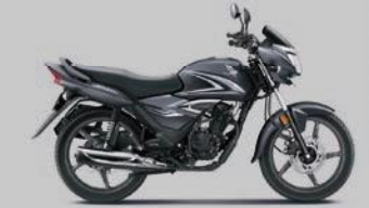
MATTE AXIS GREY